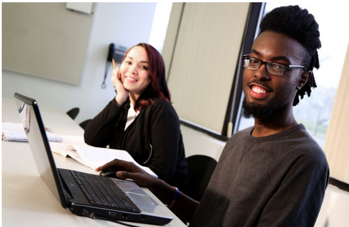
Lorain County Community College

In the face of these circumstances, ATD is helping community colleges address their biggest challenges — removing the barriers for access, equity, and success for racially and economically marginalized populations; accelerating student success work; and helping to transform community colleges to become hubs of economic growth and workforce development in their communities.