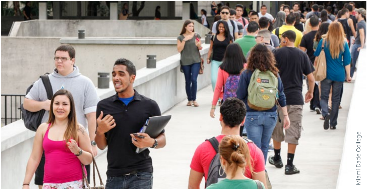
Miami Dade College

To address these challenges, ATD has led the way with new strategies, new coaching, new resources for colleges, and new expertise and internal capacity for leadership. This year the organization secured the largest investment in our history. The $20 million gift from philanthropist MacKenzie Scott will allow us to secure our future, expand our focus on equity, and bring support to new regions and institutions that have lacked the resources to benefit from ATD’s approach to student support and institutional transformation.