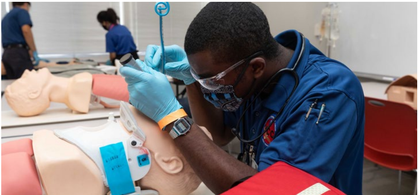
Houston Community College

colleges to create more flexible educational programming to help students progress through programs more efficiently and move more easily between work and college. Central to this work is rethinking how we measure the success of our programs and our institutions.